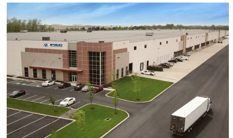
• Bethlehem, Pennsylvania – 410,000 sq. ft.