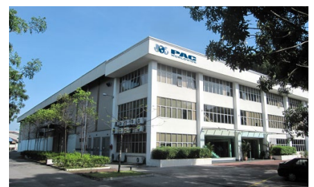
• Kuala Lumpur, Malaysia – 105,000 sq. ft.