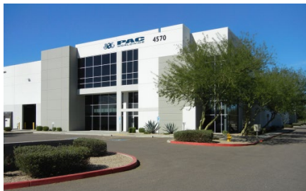
• Phoenix, Arizona – 330,000 sq. ft.