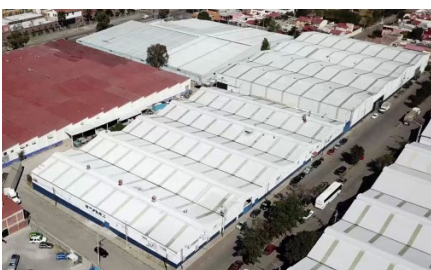
• San Juan del Rio, Mexico – 100,000 sq. ft.