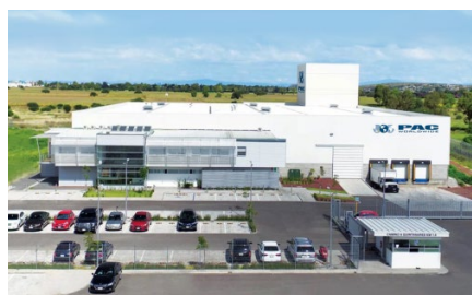
• Pedro Escobedo, Mexico – 50,000 sq. ft.