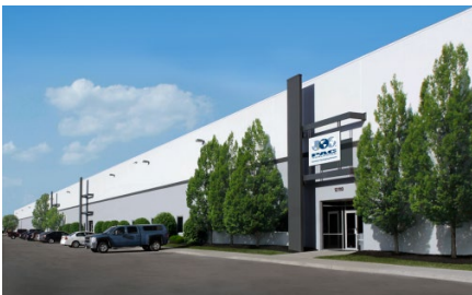
• Cincinnati, Ohio – 210,000 sq. ft.