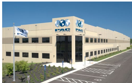
• Middletown, Ohio – 360,000 sq. ft.