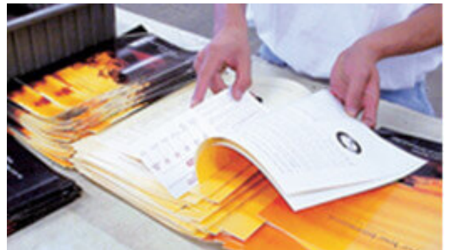
Collating and Sorting