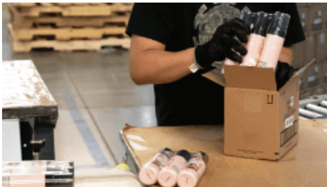
Reworks and Inspection