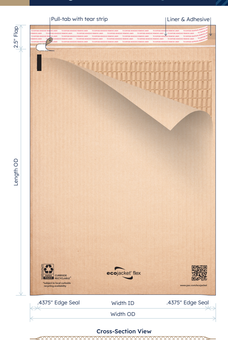
3/32" flute height